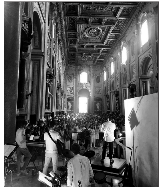
The throng of pilgrims gathers in St. John Lateran before setting out for St. Peter’s Square

The next day was another busy day of exploring as “Together” didn’t officially begin until Friday evening. We began with a guided tour of the Vatican Museums and wandered through the art galleries and archaeological collections from popes over the centuries. The tour concluded at Michaelangelo’s miraculous Sistine Chapel. Later we ventured to the Colosseum, the world’s largest amphitheater, to learn more about the Roman Emperors and gladia-