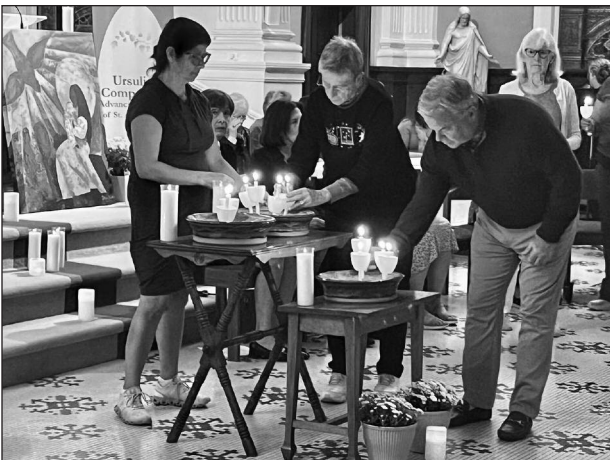
Participants placed lit candles in bowls representing their silent prayer intentions during the Taizé prayer vigil.

Light refreshments and fellowship followed where individuals expressed appreciation for the evening's program and for the opportunity to take time from busy schedules and become still and quiet in the presence of God.