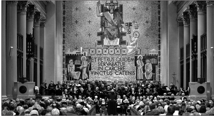
Members of 17 religious communities, including the Ursulines of Cincinnati, participated in “Wake up the World: A Concert Celebrating the Year of Consecrated Life.”