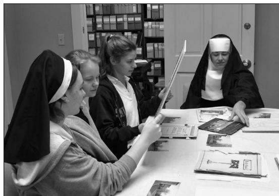
A senior religion class discussed – and experienced – the habits worn by women religious during a visit to the Archives.

Those who have been enriched by the Ursuline family want to play a part in passing along that heritage to current and future generations. That's the primary reason the archivists meet every week.